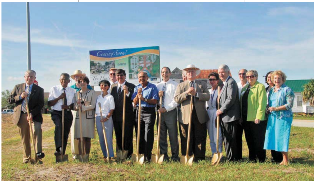
With historic houses in the background, lots of helping hands were available to break ground for the Health Village at Main Street PMC.

"Knowing the generosity, compassion and community spirit of the people who live here,